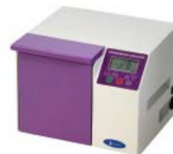
Stomacher® 400 circulator

The Stomacher® 400 Circulator is the World's leading laboratory blender. When food safety and quality matter the Stomacher® can be relied on to safeguard your reputation.