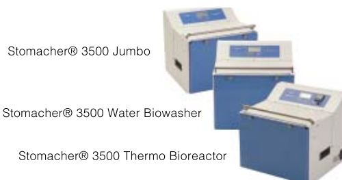
Stomacher® 3500 Jumbo