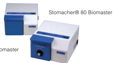
Stomacher® 80 micro Biomaster

The Stomacher® 80 Biomaster, microBiomaster and Stomacher® bags allow samples to be processed safely and without risk of cross contamination at the same time as maximizing the effectiveness of your subsequent protocols.